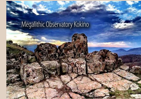
Megalithic Observatory Kokino