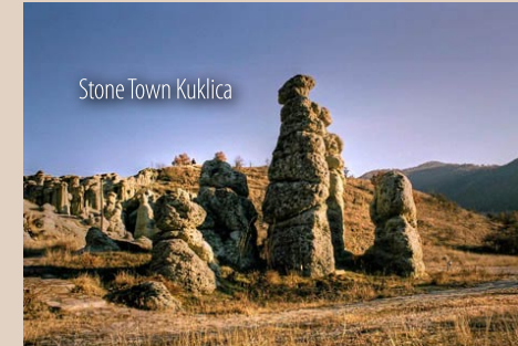
Stone Town Kuklica