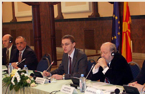
JPC EU-RM Meeting in Skopje

First, allow me to send my best and warmest regards to each of you on behalf of your Macedonian counterparts and colleagues. We are looking forward to working closely with you throughout these next five years of this mandate of the European Parliament.