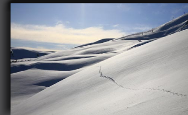
Mount Sar Planina