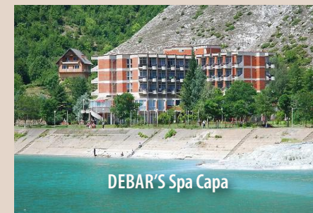
DEBAR'S Spa Capa