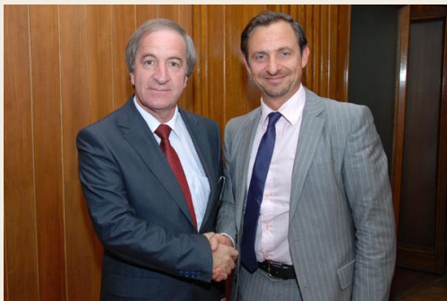
The two JPC Co-Chairs met for the first time on the 5th September 2011 in the Macedonian Parliament to exchange views on the incoming JPC activities. They both welcomed the fruitful cooperation in the past and expressed hope that this positive atmosphere will continue to be present in the future work of Committee.

Allow me at the beginning of the new mandate of the Assembly of the Republic of Macedonia 2011-2015, as the JPC Co-Chair in this parliamentary composition, to greet you warmly in the latest edition of our Newsletter that will continue as before, to inform you on the Euro-Integration processes of our Parliament. I have accepted with pleasure my appointment for the new office and I am sincerely counting on your close and open cooperation in the next years of this mandate.