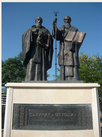
Statue of Cyril and Methodius in Skopje